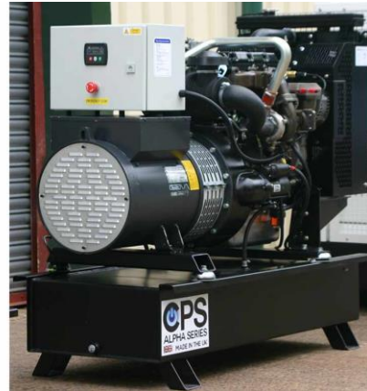
AP30/S-AP60/S, Three Phase, 30-60 kVa AP21/S-AP40/S, Single Phase, 21-40 kVa